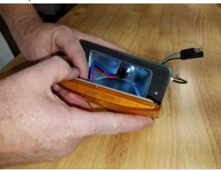
Tighten lens screws and you are done.

You may find it easier to use the lens screws to hold the LED board in alignment.