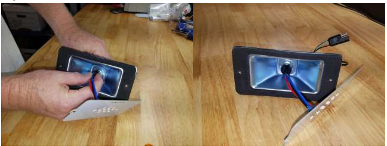
Plug 1157 cable to brake socket.