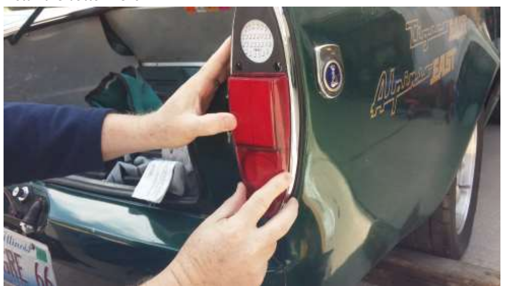
Install the top lens