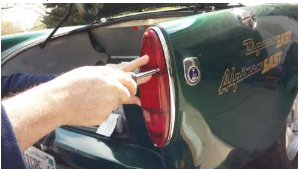
Now enjoy your Vintage LEDs Tiger Lights