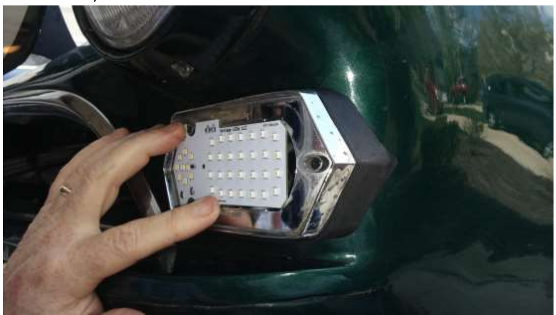
Place the gasket over the LED board

Press the board against the light housing. There are alignment slots above the white LEDs. The turn LEDS should fit inside the cavity where the bulb was.