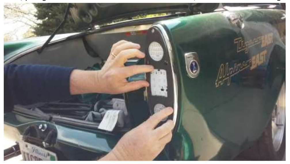
Install the bottom lens

Note, your gasket will not have the cutout in the center; this was for a custom light.