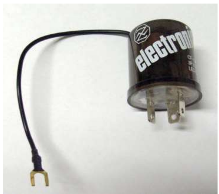
The LED flasher is available online.

Note: The black wire on the LED flasher will need to be connected to chassis ground.